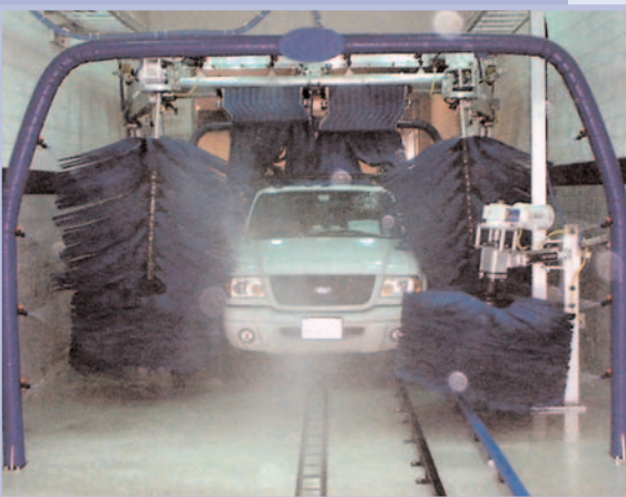
Optional Low Side Washer shown.

The insta-KLEEN's™ Equipment Control Center is literally a "backroom in a box," housing and integrating all of the support and control equipment, plumbing and valves, chemical metering and utility distribution into an orderly and user-friendly platform.