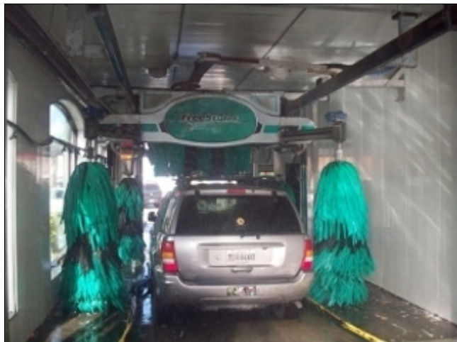
Key Highway BP's FreeStyler® in action!