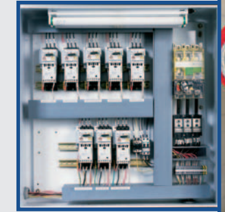
All Belanger components are built to withstand rigorous use day in and day out. Optional 50hp AirCannon shown.