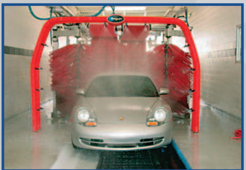
Bright colors and soft lines offer an inviting look and help optimize the customer experience.

Bright colors and soft lines offer an inviting environment that attracts attention and enhances the customer experience. The Enduro Class 60™ is packaged as an attended system. A self-loading option is also available.