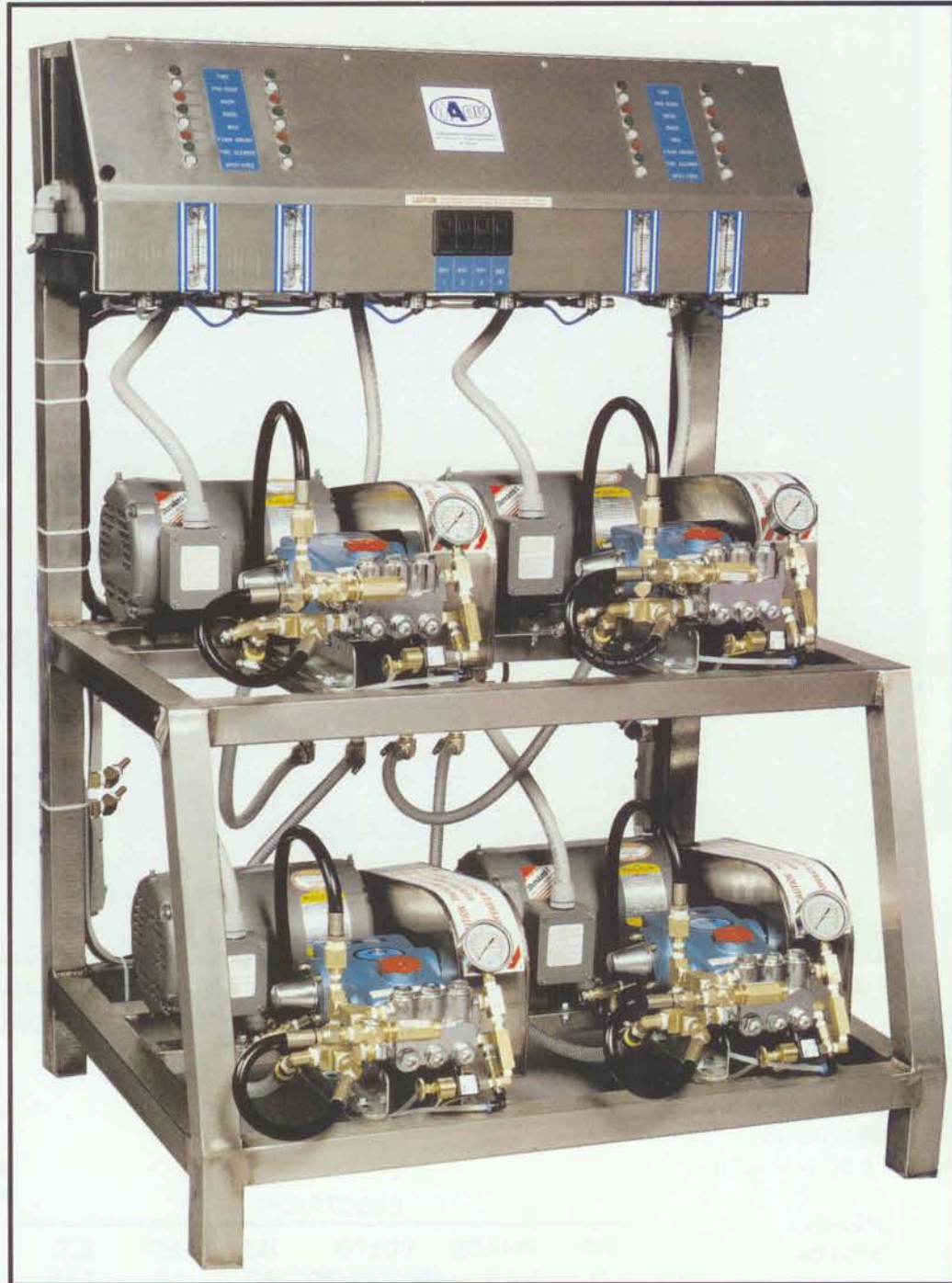
Shown with optional Stainless Steel frame