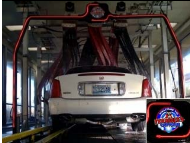
Pre-soak arch helps reinforce the Terrible's brand